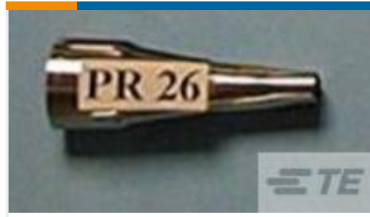
TE Part # 991967-000 PR-26-REFLECTOR